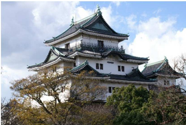
① Wakayama Castle